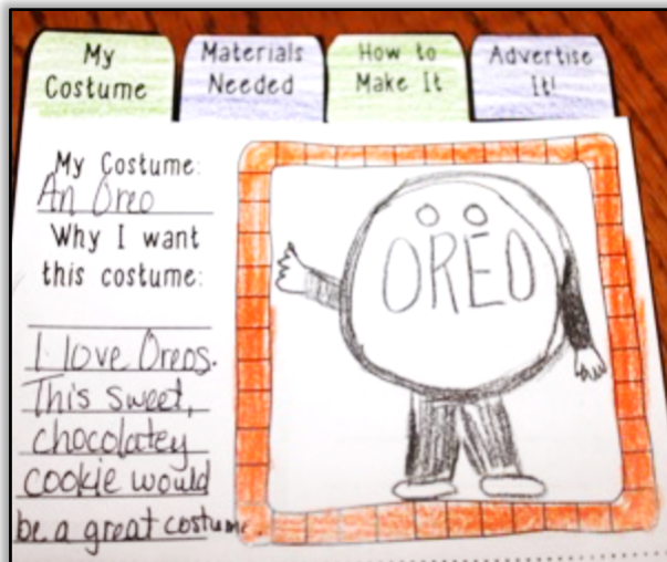
Create a Costume