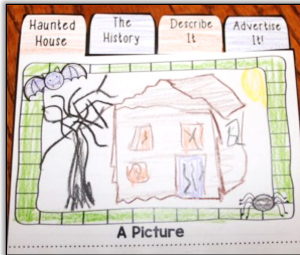
A Haunted House