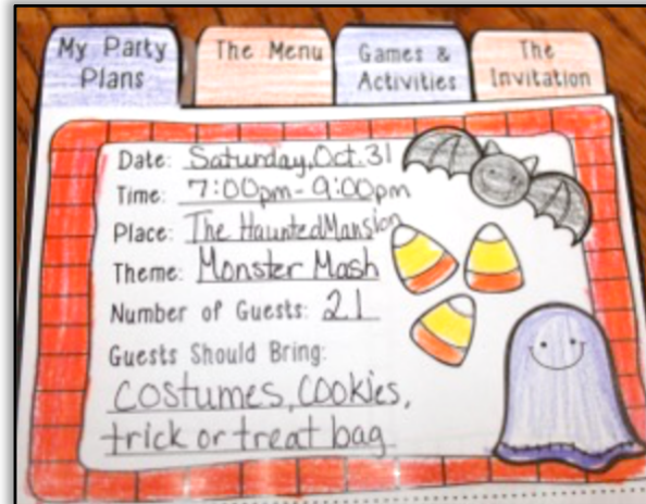
A Halloween Party